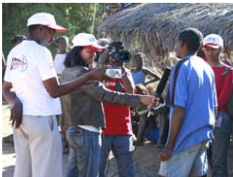
The Roving Camera in action.

For the first time in its history, the Republic of Madagascar now has a ministry responsible for drinking water, integrated water resources management and sanitation issues. Its creation, announced in July, stems from President H. E. Marc Ravalomanana's commitment at the African Union Summit in June to make drinking water and sanitation national priorities.