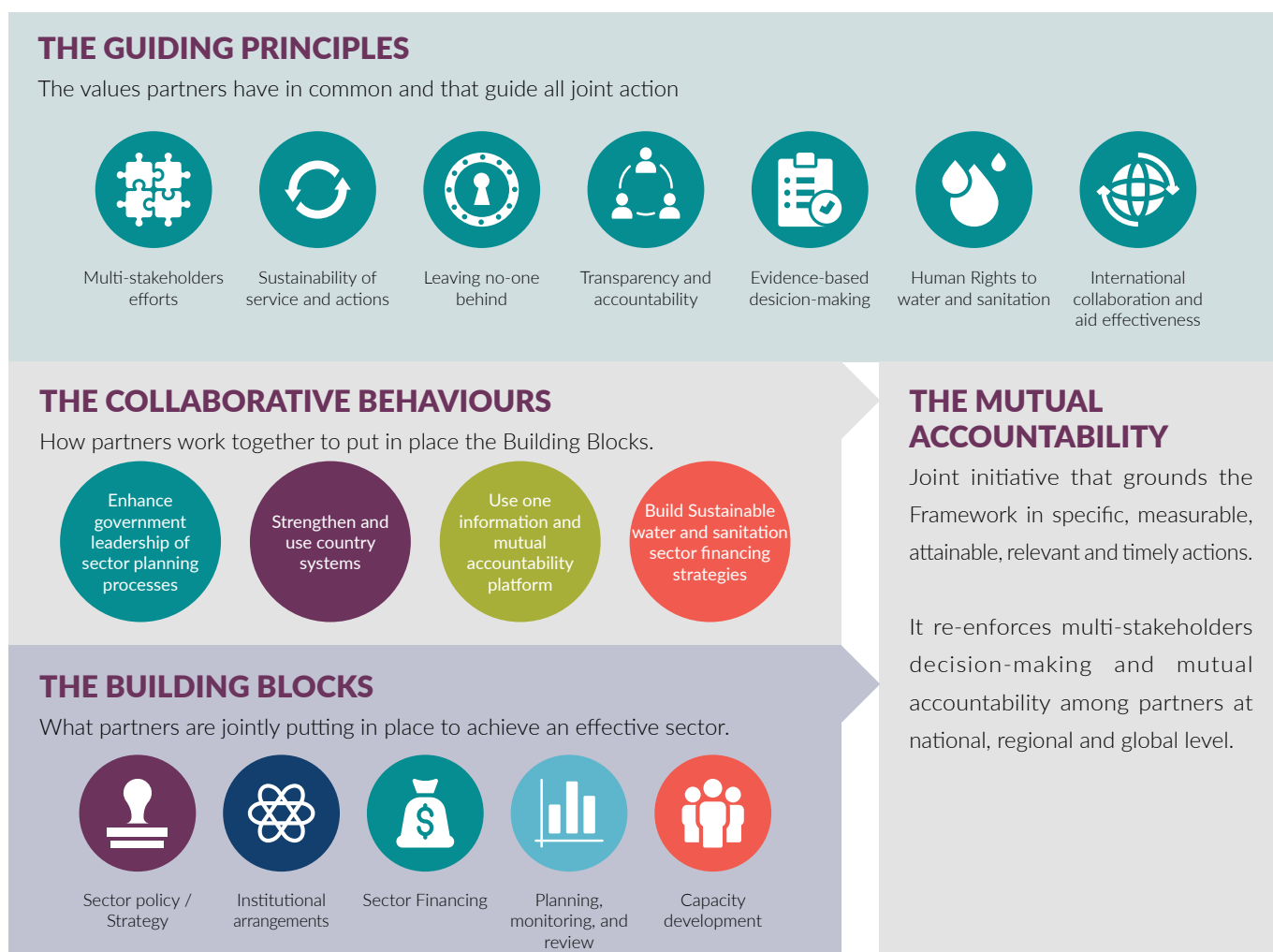
The SWA framework

to engage and elevate voices across society, and secure the benefits of sanitation and hygiene and menstrual health and hygiene for all, confront cultural misconstructions and misconceptions, taboo and stigma, and the barriers, at the origin of inequalities.