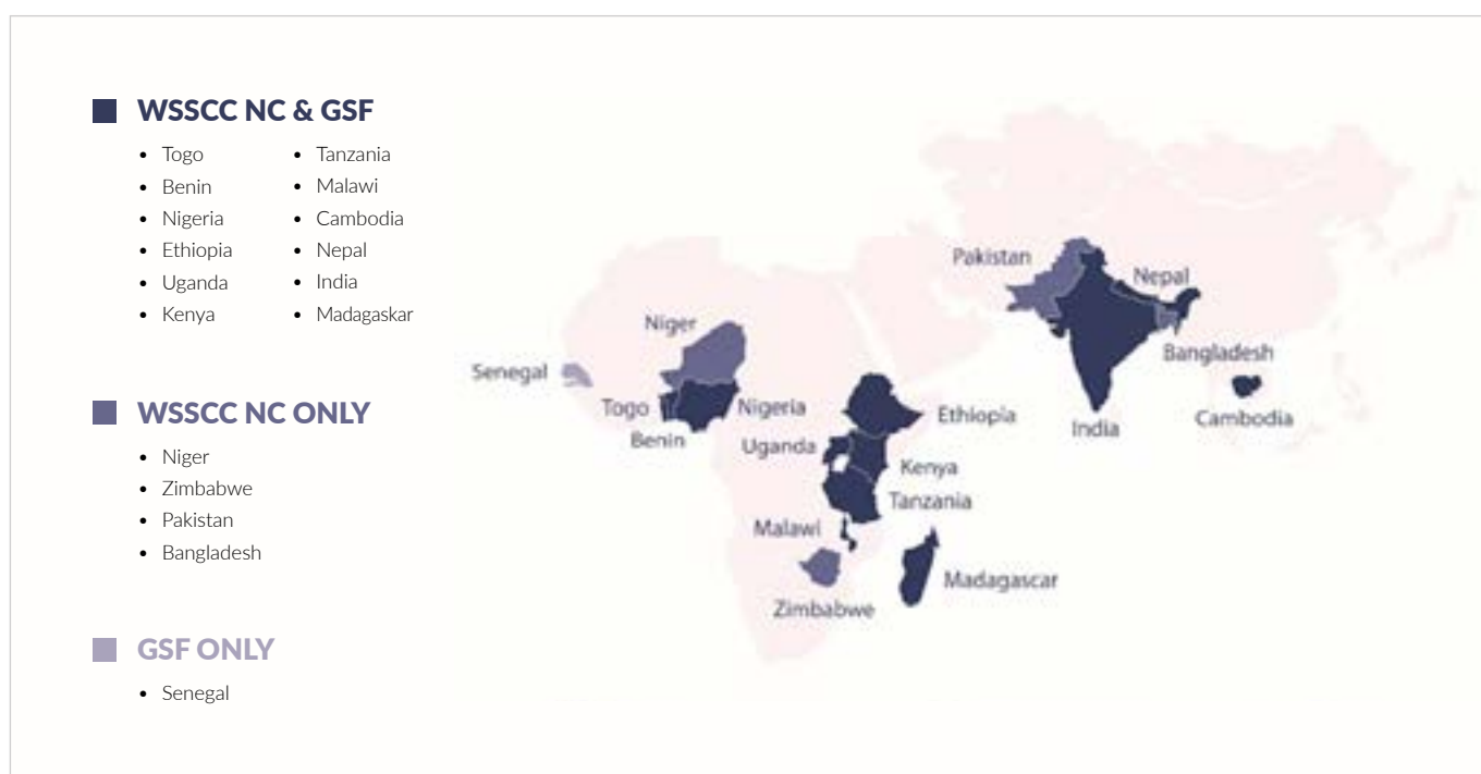
Countries of WSSCC engagement