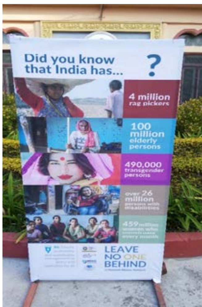
Billboard with data on vulnerable groups in India. Picture taken at LNOB Summit in Rishikesh, India, 16 - 18 December 2019; WSSCC supported the organization of LNOB consultation with 14 vulnerable population groups on SDG 6. The report is shared with the UN Country Team in India as input in the national report of India for the 2020 Voluntary National Review of SDG 6

Discrimination and stigma push persons with disabilities to the end of the line , which is a key health issue: many persons with disabilities rely on water and sanitation for their health needs. So, if we want to achieve Goal 6, we cannot leave behind all the other SDGs: they have to be realized in conjunction . I was very happy to see that WSSCC provided data, indicators showing worldwide access to WASH services, however can you disaggregate these numbers by vulnerable groups? Can you show how many are persons with disabilities, or elderly above a certain age, or women and girls? Because to talk about these issues with data is extremely important, especially when we come to the High-Level Political Forum (HLPF) and the Voluntary National Reviews (VNR).